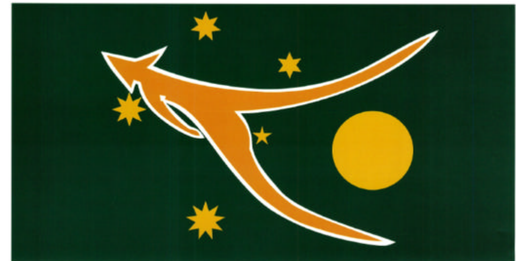
The Green and Gold sports flag of Australia

Look up at your flag, and see your country