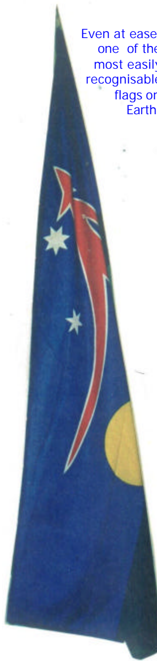
Even at ease one of the most easily recognisable flags on Earth